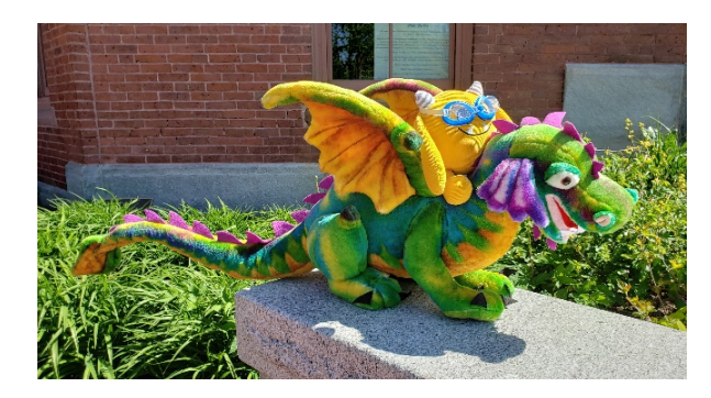
Tuesday, January 11 from 4:00 to 4:45 PM