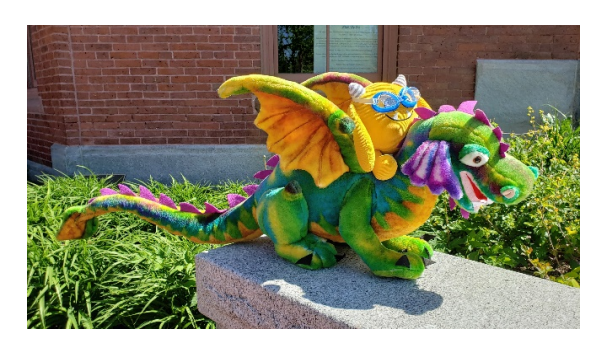
Tuesday, November 16 from 4:00 to 4:45 PM