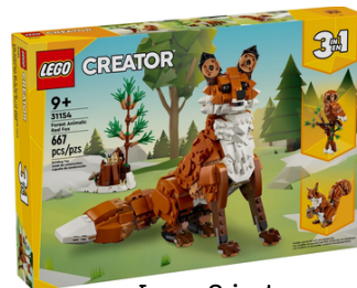
Lego 3 in 1 Woodland Creatures Set