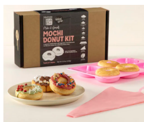
Mochi Donut Making Kit