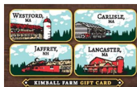
$25 Kimball Farms Gift Card