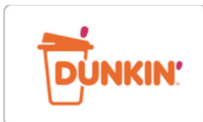
$25 Dunkin' Gift Card