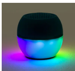
Mini Bluetooth Speaker