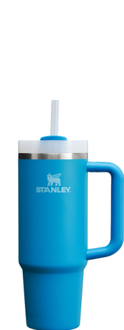
Stanley Water Cup

Use your tickets to compete for raffle prizes like these!